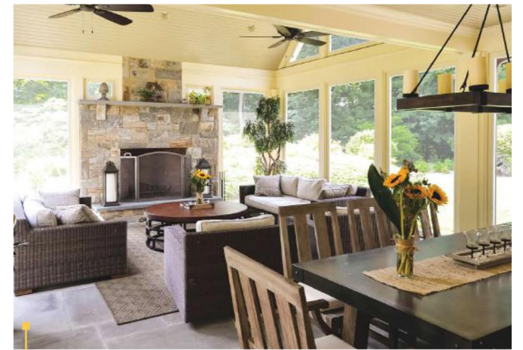
The placement of the fireplace at the far end of the porch was intentional to avoid having it be in line with an interior fireplace from the perspective of the family room.

Siding: Michigan Prestain Shingles, doors and windows: LePage Garage doors: Artisan Paint/stain: Benjamin Moore and Sherwin-Williams