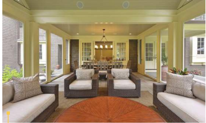
The porch addition, while one structure, arguably functions as two rooms. The dining area seats 10 and has a lower ceiling, due to the low-pitch roof design to not block the view from any bedroom windows. A vaulted pitched roof allows the sitting area to open dramatically, and has a brick and stone fireplace.

Fortunately, for Contelmo, budget was not a primary consideration with this project. QR